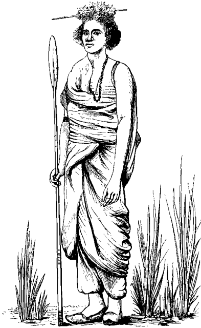
THE YOUTHFUL CHIEF.

negro friends of long ago at Laguna! He sat down, however, in the rest-house, surrounded by his special suite; and an indiscriminate