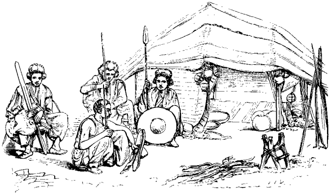
BIRSCII HUT AT DAGA.