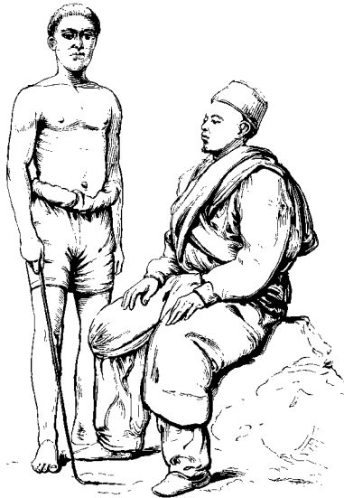
EGYPTIAN SOLDIERS COME TO COLLECT TRIBUTE.

and off his angréb he at length dragged himself, and condescended to sit up, while I mentally pictured to myself the situation had I arrived there alone.